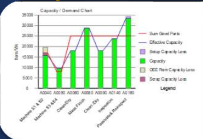
Cycle Time/Takt Time